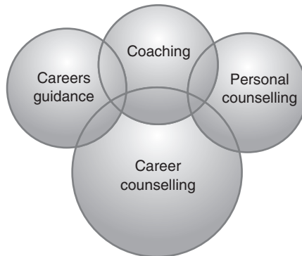
Figure 1.1 How career counselling overlaps with other forms of help

In addressing personal concerns regarding redundancy, retraining, relocation, retirement, relationships at work, promotion, career breaks and stress, career counselling necessarily overlaps with personal counselling.